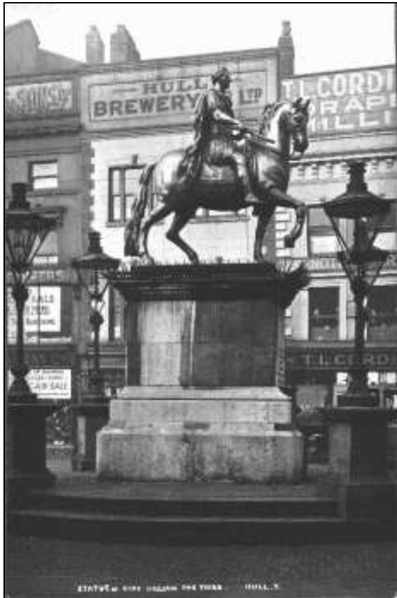
Figure 6 King William in the early 1930s.

Late in 1991 the future of the King William was put in doubt when it was declared